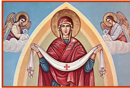
Our Lady of Protection Ukrainian Madonna

We pray for our sisters and brothers in Maui, Morocco, Middle East, (Oct. 7, 2023) and Libya... and the 32 places where war is being raged now.