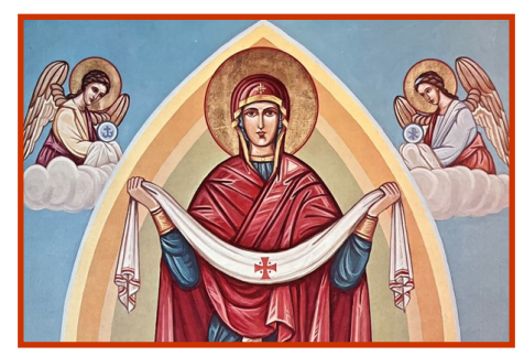
Our Lady of Protection Ukrainian Madonna