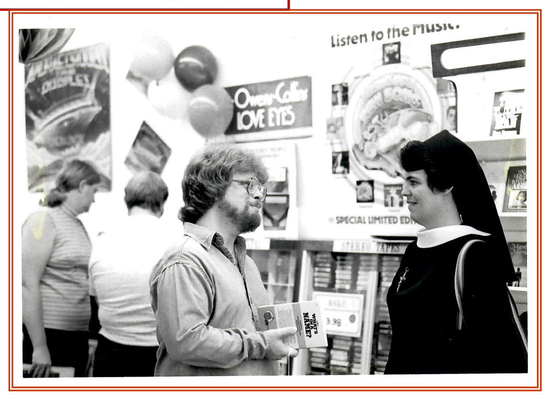
Falls Church, 1970