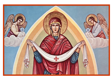
Our Lady of Protection Ukrainian Madonna

We pray for our sisters and brothers in Maui, Morocco, Middle East, and Libya.